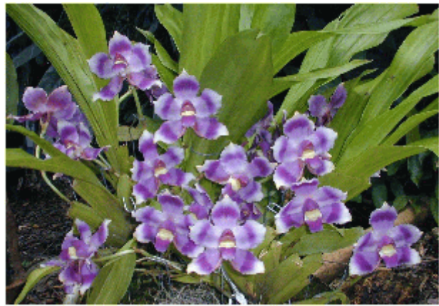
Bollea coelestis

This is the area enclosed by the three mountain ranges. The Cauca Valley is between the western and central ranges and the Magdalena Valley is